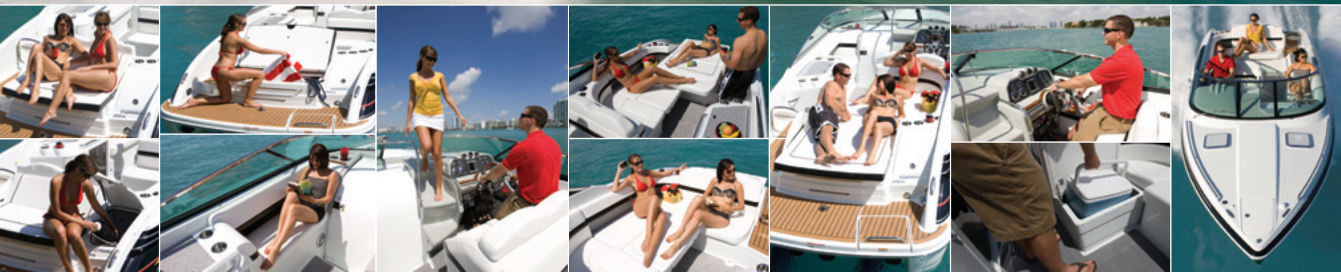
BLACK ONYX METALLIC FLAGSHIP ELITE IMRON® GRAPHIC AND COCKPIT ACCENT STRIPING