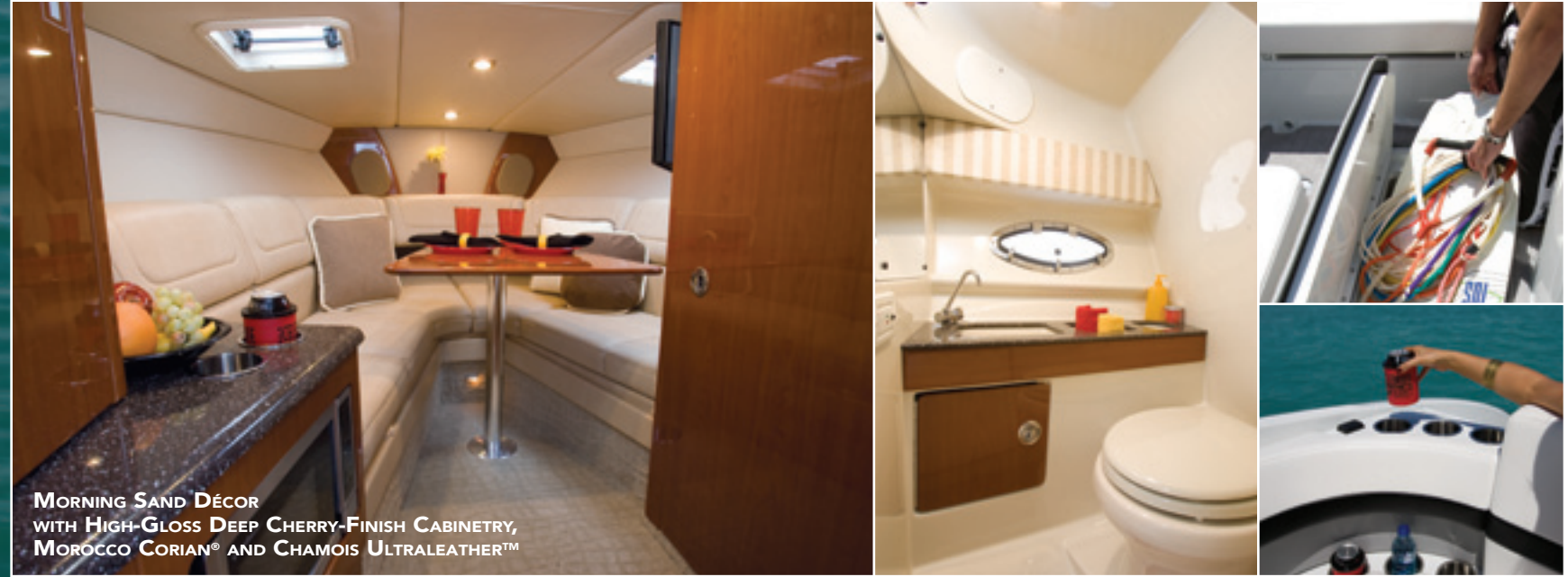
MORNING SAND DÉCOR WITH HIGH-GLOSS DEEP CHERRY-FINISH CABINERY, MOROCCO CORIAN® AND CHAMOIS ULTRALEATHER™