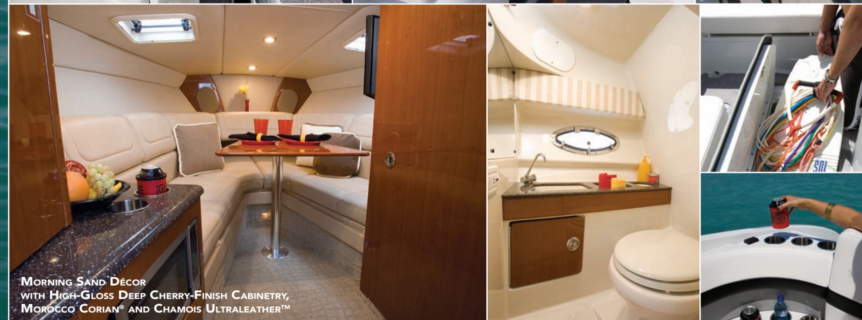
MORNING SAND DECOR WITH HIGH-GLOSS DEEP CHERRY-FINISH CABINTRY, MOROCCO CORIAN® AND CHAMOIS ULTRALEATHER™