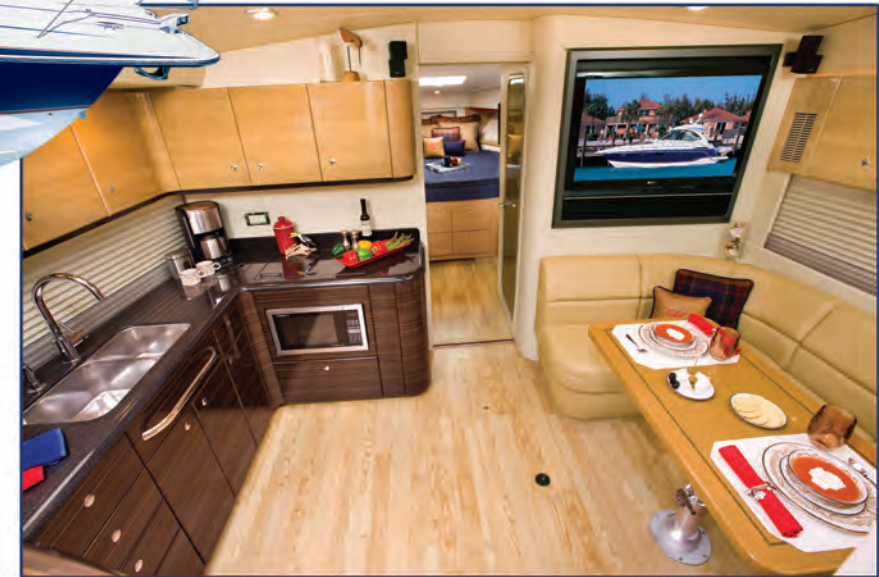
HIGH-GLOSS ASH-FINISH UPPER CABINETS, HIGH-GLOSS DEEP ZEBRANO-FINISH LOWER CABINETS, NIGHT SKY CORIAN ® , BUCKSKIN ULTRALEATHER ® AND ASH-FINISH FLOORING

Formula is excited to unveil the new upscaled look of the Ralph Lauren cabin décor packages in the 45 Yacht. Completely new cabinetry, Corian ® , flooring and doors lend a luxurious feel to the beautiful Ralph Lauren ® fabric choices of the Coastal and Mystic Cove color palettes.