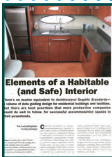
Elements of a Habitable (and Safe) Interior

The Formula 45 Yacht was featured in an article in the April/May 2009 issue of Professional BoatBuilder . It was used as an example of “a galley done right: double sink, natural light through a large port, ample storage and work space, recessed cooktop, and grabrails at the workstation and companionway steps.” Check out the 45 Yacht at www.formulaboats.com .